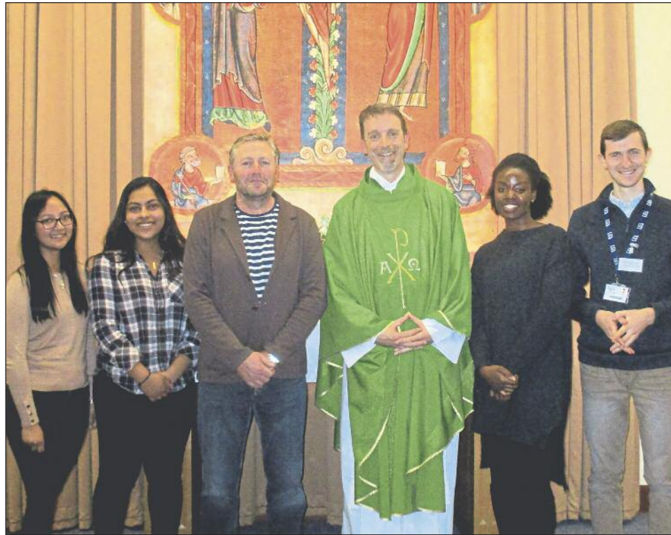
■ The Norwich Circle of the Catenian Association followed their 56-year tradition of entertaining Catholic students at the University of East Anglia on the third Sunday of October after the 6pm Mass on October 20.

"We have now run this candlelit Mass for several years," he said, "and we find it is a really uplifting way to end the