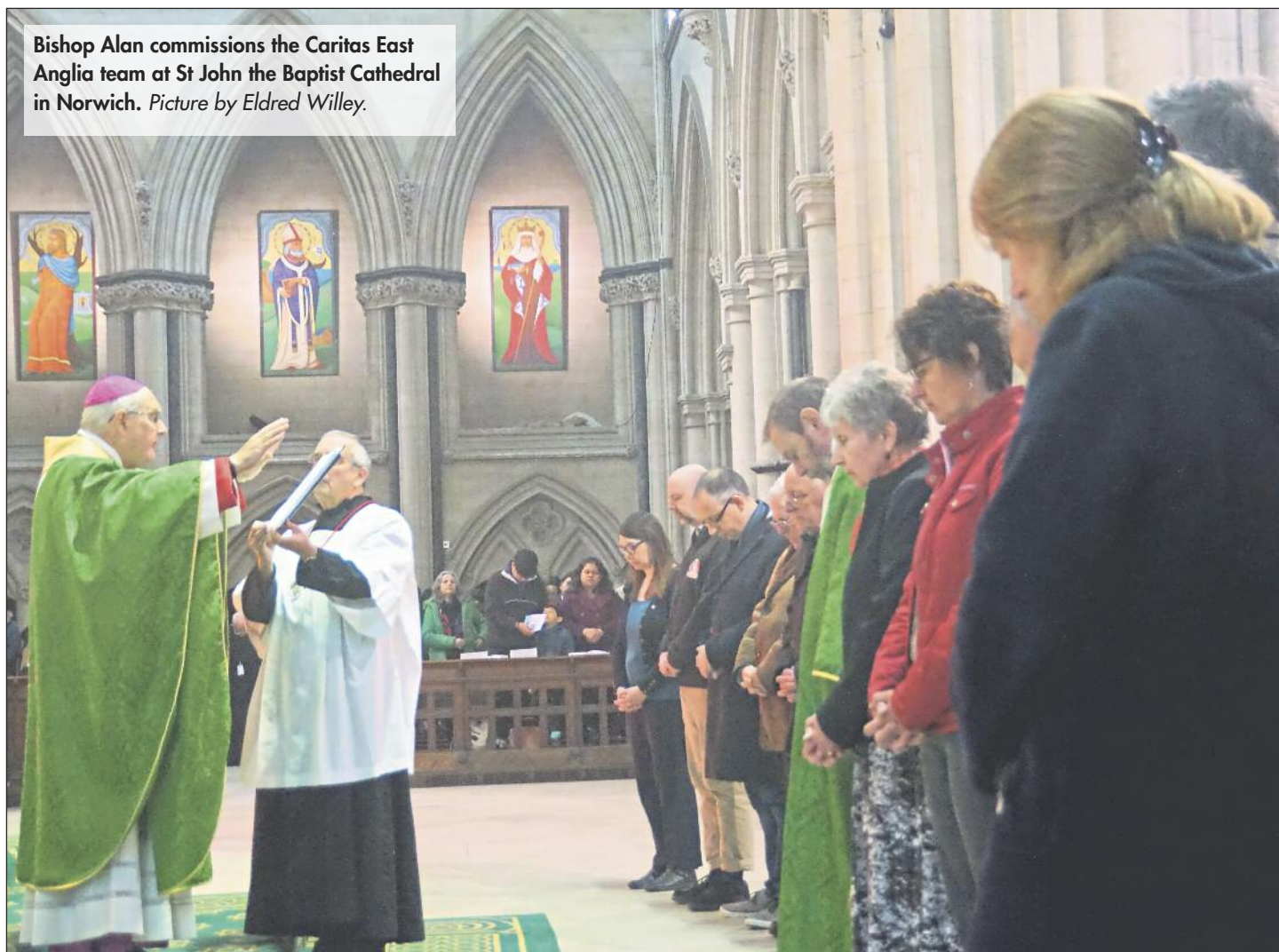
Bishop Alan commissions the Caritas East Anglia team at St John the Baptist Cathedral in Norwich.

New Catholic primary school plan is backed – page 8