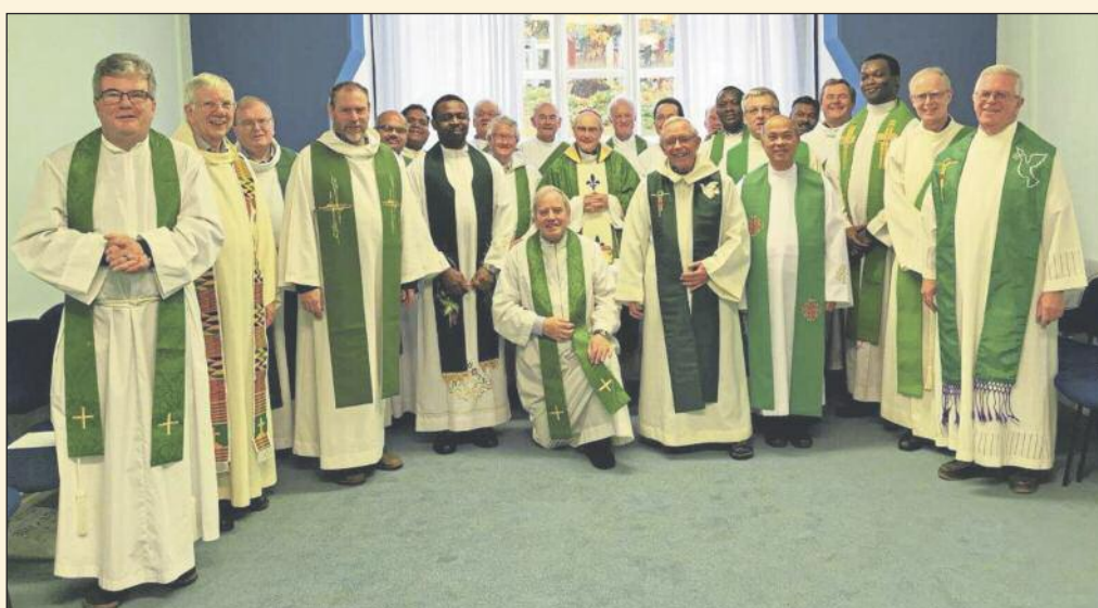
■ Pictured above, Bishop Alan celebrated Mass with diocesan priests at the Belsey Bridge Conference Centre in Ditchingham during a Study Day for Clergy on November 7.

■ A photograph of sunshine and incense after the Solemn Sung Mass on the first Sunday of GMT (30th Sunday in Ordinary Time). St Mary's, Thetford, which is the oldest free standing Catholic Church in East Anglia. Opened in 1820 – before Catholic Emancipation, the older Chapel is the Sunken Chapel at St Edmunds, Bury St Edmunds (1685 & 1791). Both churches were founded and served by the Society of Jesus (Jesuits) from 1685 until 1837.