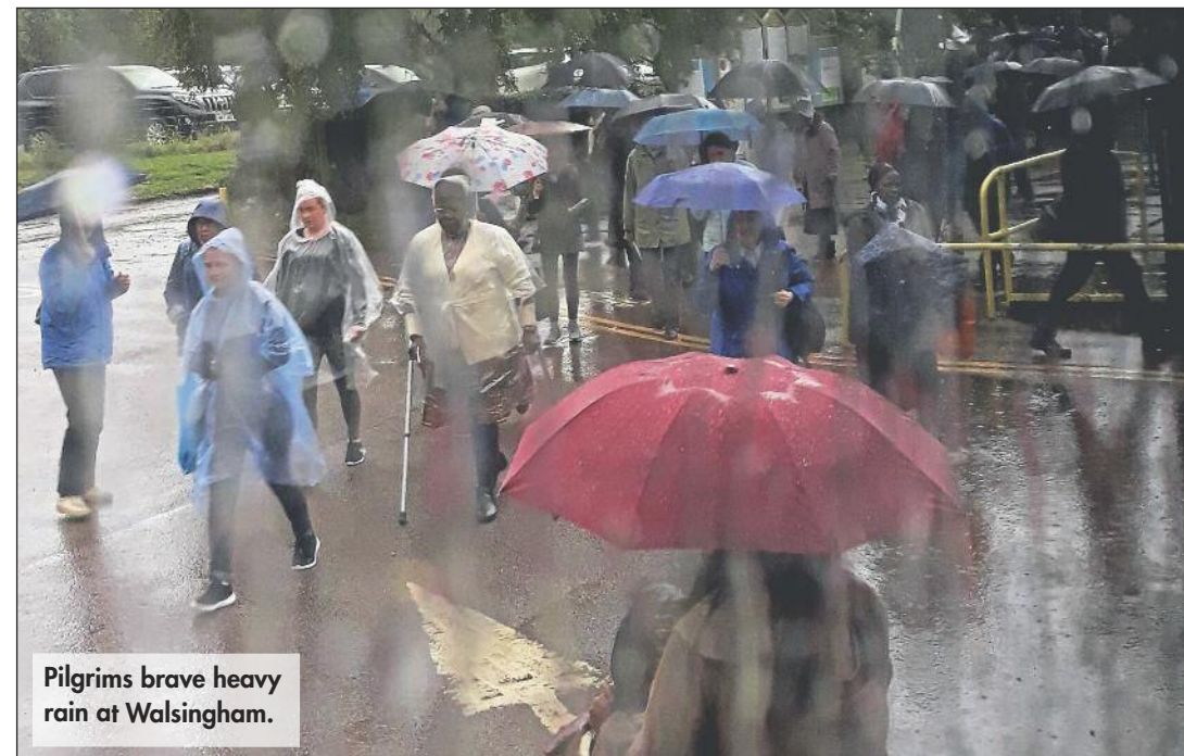
Pilgrims brave heavy rain at Walsingham.

The Holy Mile was impassable in some places, causing the procession into the village to be cancelled; Bishop Mark O'Toole, who intended to take