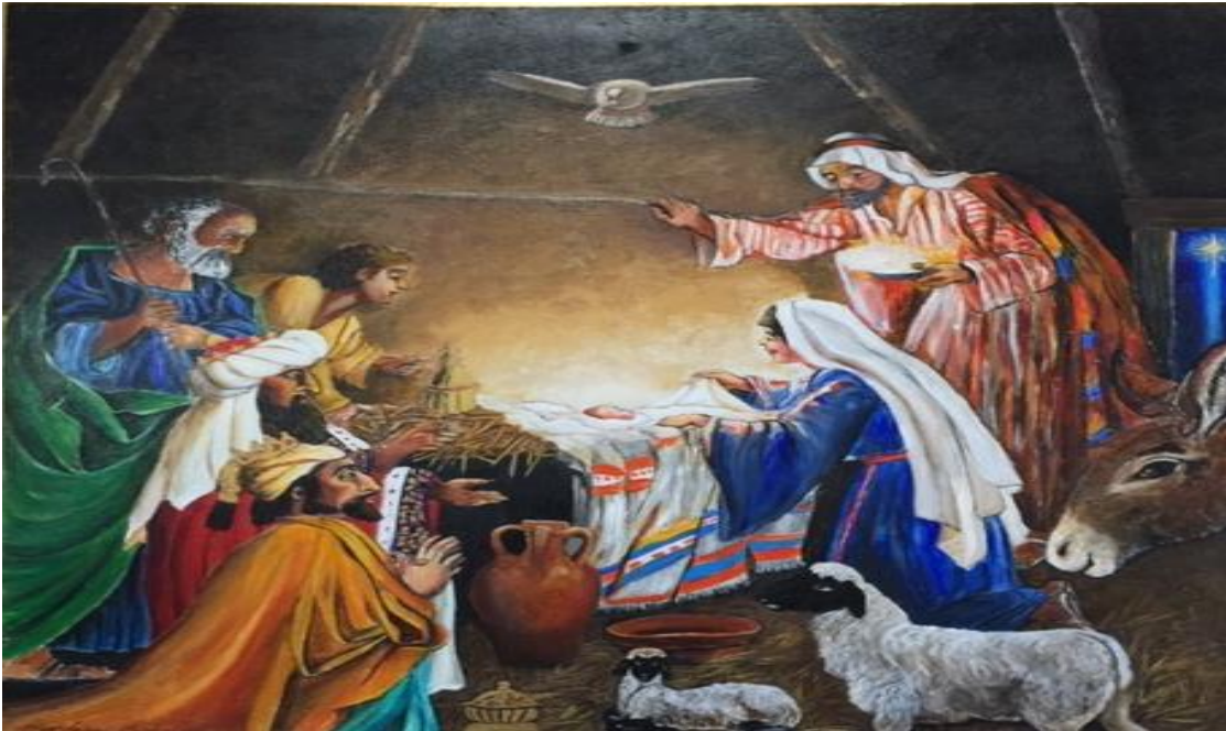
A picture from Poringland Church

May the Blessings of Christmas be with you today and always.