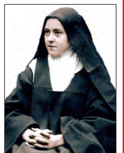
St Therese of Lisieux

Please quote reference ANGL02 with all enquiries.