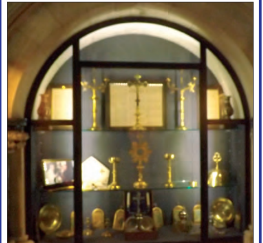
A selection of some of the artifacts that have graced the cathedral and been used in its services earlier in its history are on display