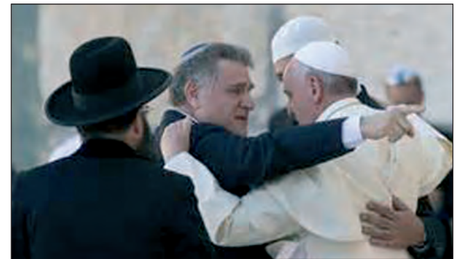
Pope Francis was greeted by members of all communities

"The Pope will not see all the misery of the Holy Land, but he is meeting a number of families, hearing their cares and concerns. It gives us a good boost, it inspires us to continue our mission."