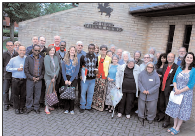
Parishioners at St Luke's in Peterborough welcomed two priests from Ethiopia who thanked them for their support