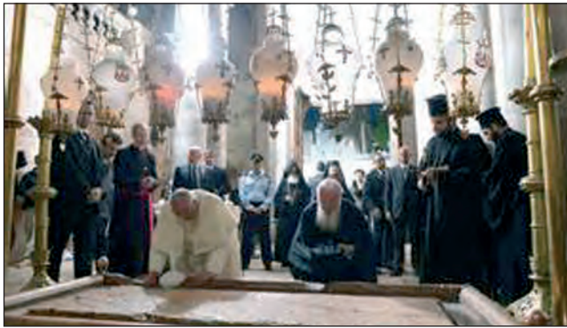
Pope Francis spoke with power and humility

Pope Francis prefers to dine with the poor and downtrodden to hear about their plight