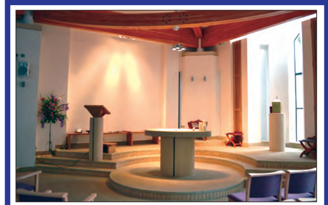
The newly extended church at Clare Priory