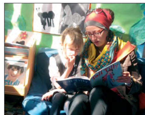
One of the parents taking part

"Fun, great activities, well planned and lovely to be able to work alongside our children, I've been to both sessions and will definitely come again!"