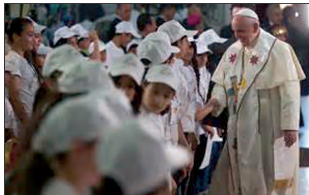
Meeting young people was a priority

It was a diverse group; parents with children, young and middle aged families and some of the families will have elderly relatives with them. There will be 20 people in total, just according to the number requested in order that the Pope will have the opportunity to talk with them and listen to them.