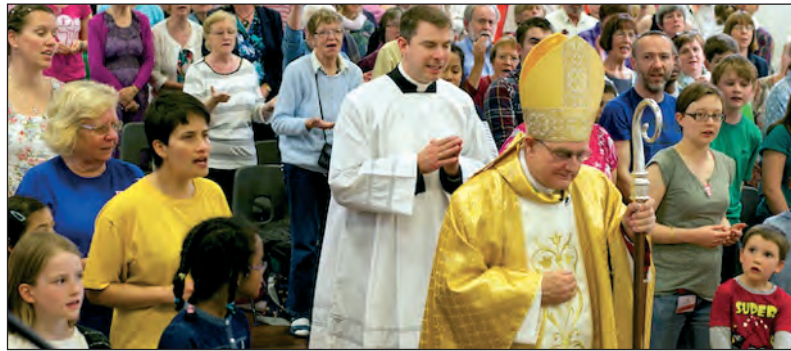
People of all ages had a great time at the Celebrate weekend event with activities, workshops, prayer, fun and games at St Benedict's school.