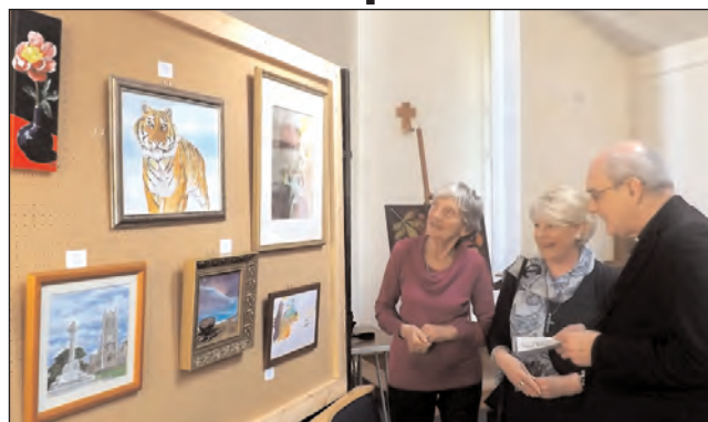
An exhibition to display the work of local artists at the Church of the Annunciation in Poringland has raised £300 for the parish. Bishop Alan is pictured opening the exhibition to fund proposed works in the church which hosts a growing community from the surrounding villages.