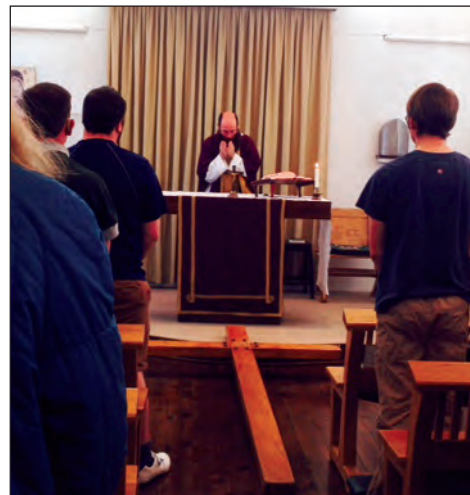
Morning Mass before setting off again