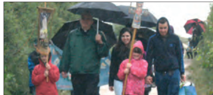
Catechumens of all ages wrote their names in the Book of Life