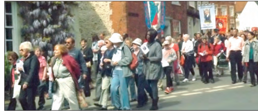
Walking to the shrine and the Chapel of Reconciliation in silence