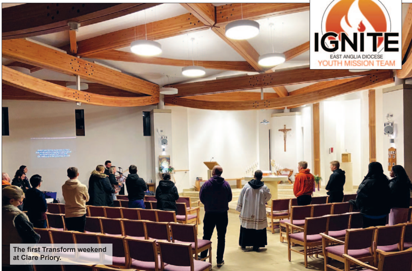
The first Transform weekend at Clare Priory.

The next Transform – Transform for Holy Week is on March 31 – April 2 (the start of Holy Week), again at the beautiful Clare Priory. It will be an opportunity to prepare spiritually for the events of Holy Week. It is intended for those age 16+. Full details at www.transform4.co.uk